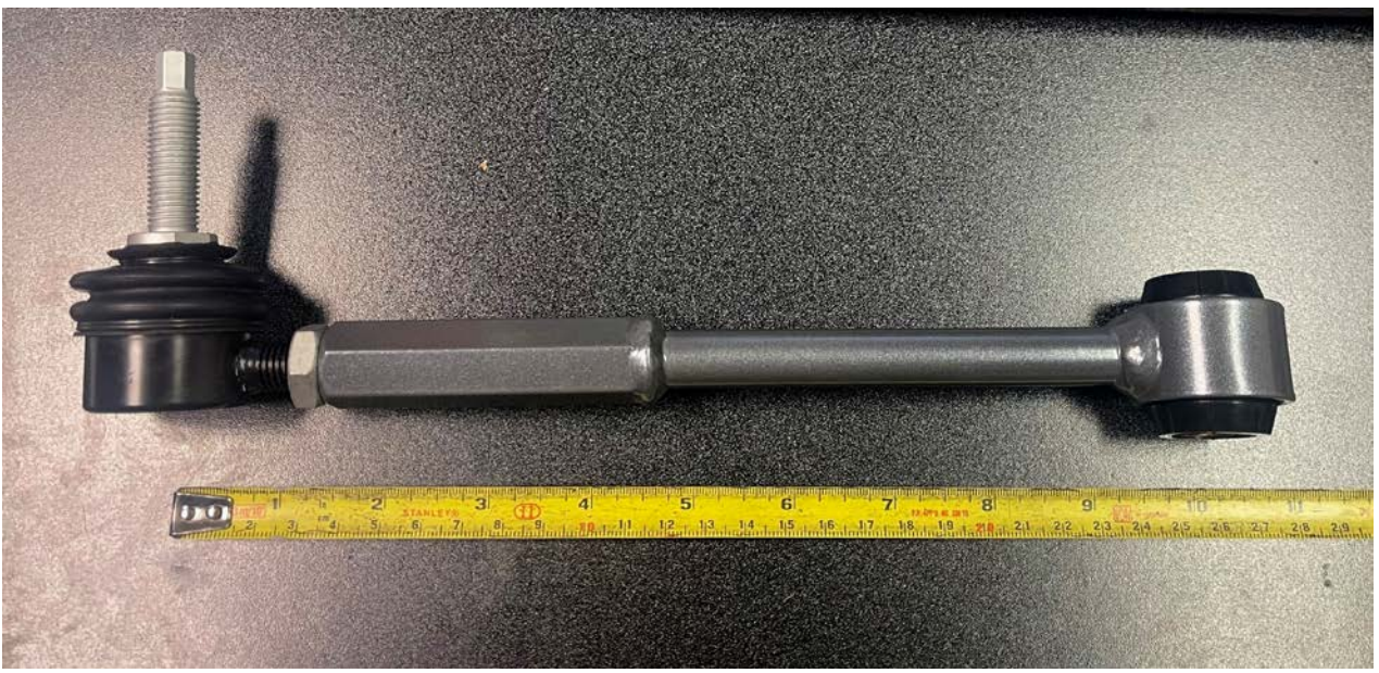
End link can be adjusted up to +1.00" longer for trucks lifted up to 2.5" (rear). Figure C

3. Assemble the end link as shown (Figure C). Adjust the end link to 10 inches from center to center for stock ride height. Lock the jam nut against the threaded shoulder of the end link. Next, attach the end link as shown (Figure D) with the M12 stud pointing towards the frame. Do not tighten at this time .