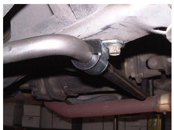
View of the new bushing bracket

5. Install the greased pivot bushings onto the anti-swaybar. Fasten the center portion of the anti-swaybar in the same location as the factory anti-swaybar. Attach the bar with the new pivot bushings and brackets.