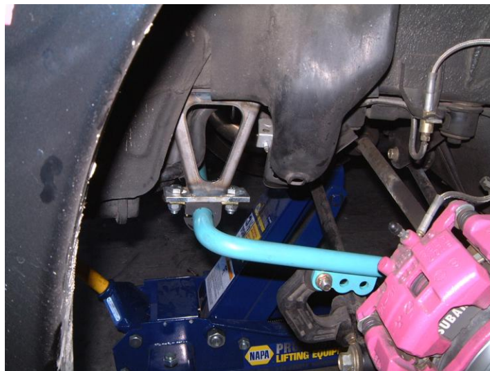
Figure 2 bar and bracket passenger side